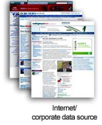
Internet/ corporate data source